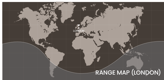
RANGE MAP (LONDON)