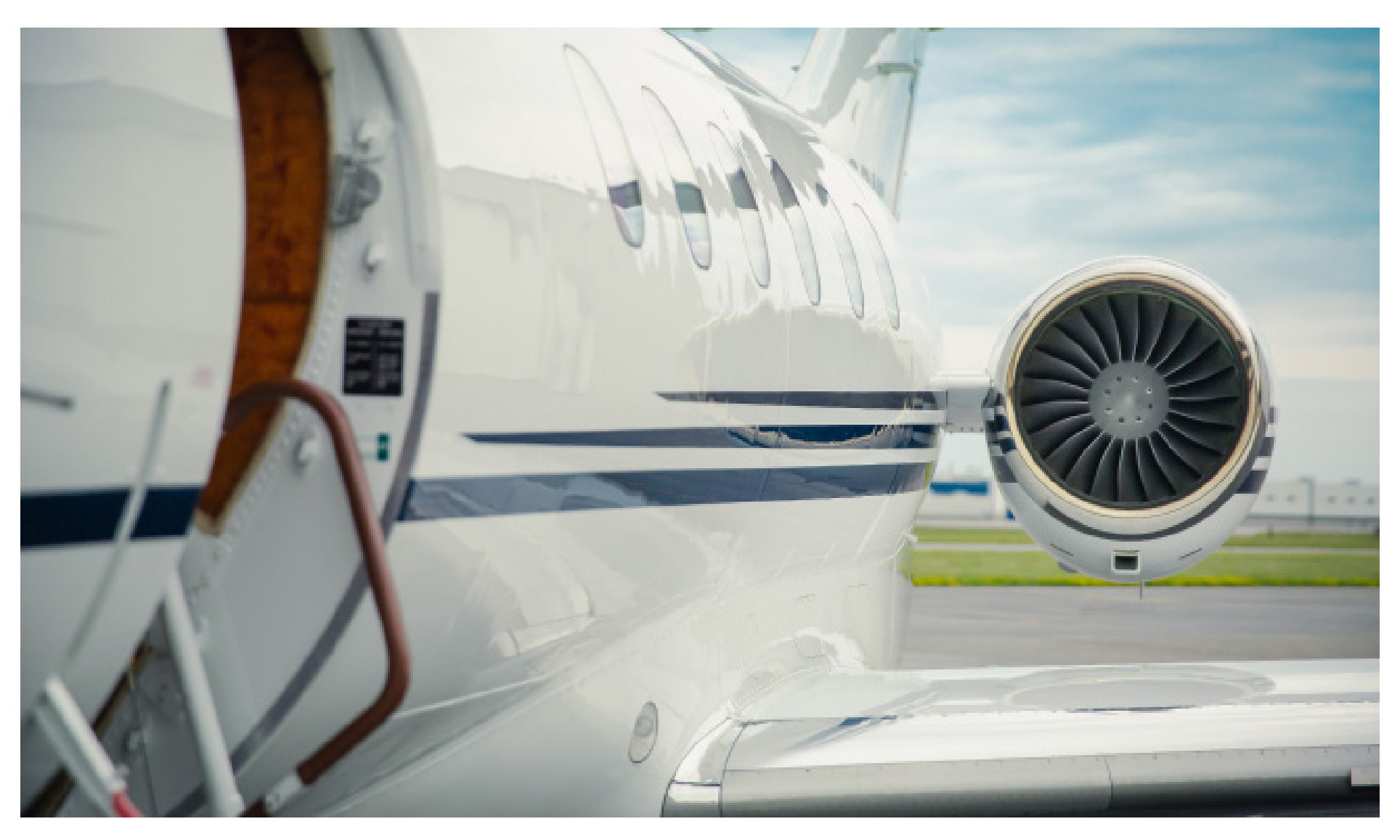
Specifications/Descriptions are provided as information and do not constitute representations or warranties of ACASS Canada Ltd. You should rely on your own inspection of the aircraft. Any proposed transaction is subject to final execution of a contract acceptable in form and substance to ACASS Canada Ltd., its clients, and their counsel.