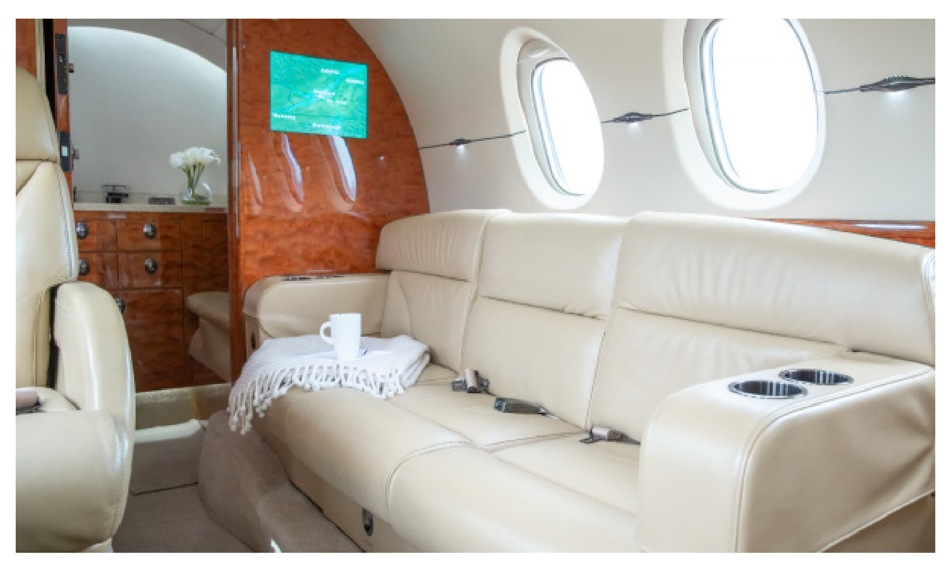
Specifications/Descriptions are provided as information and do not constitute representations or warranties of ACASS Canada Ltd. You should rely on your own inspection of the aircraft. Any proposed transaction is subject to final execution of a contract acceptable in form and substance to ACASS Canada Ltd., its clients, and their counsel.