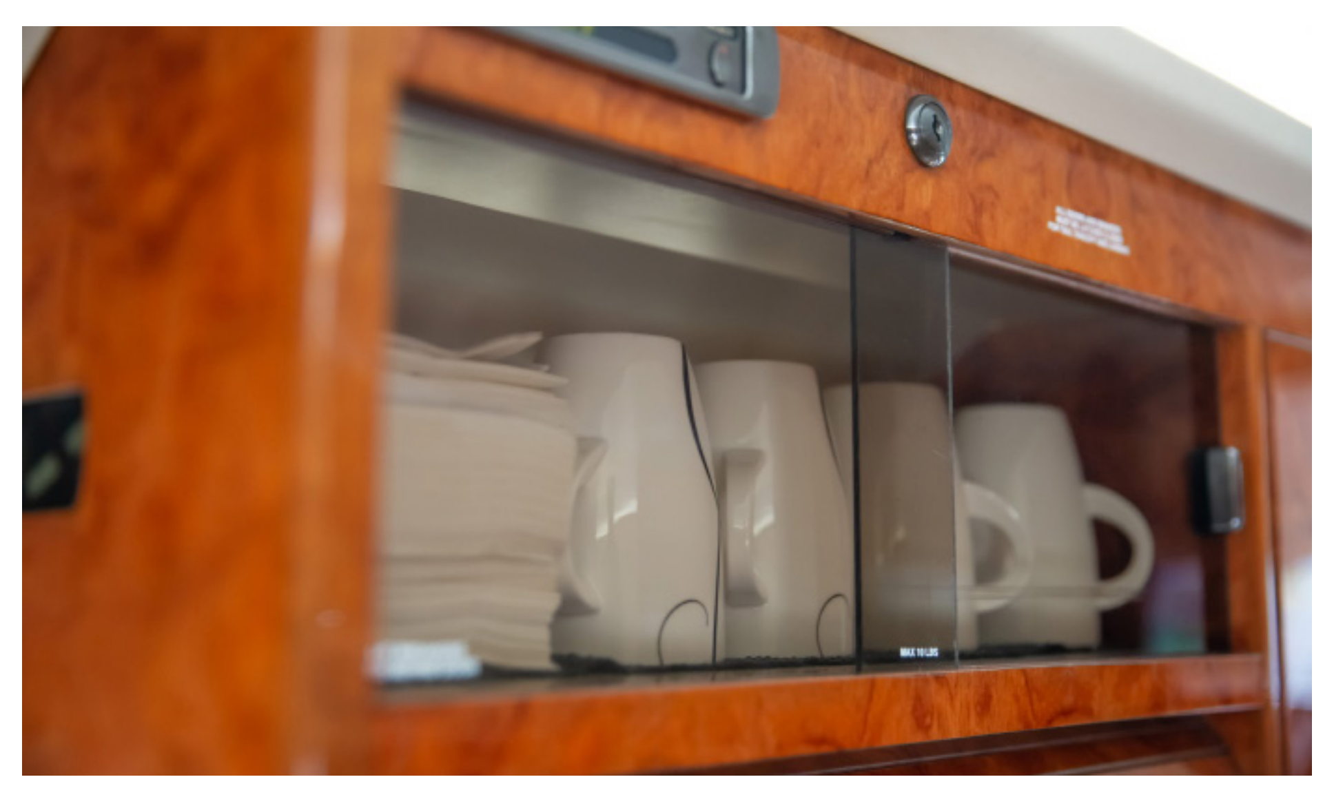
Specifications/Descriptions are provided as information and do not constitute representations or warranties of ACASS Canada Ltd. You should rely on your own inspection of the aircraft. Any proposed transaction is subject to final execution of a contract acceptable in form and substance to ACASS Canada Ltd., its clients, and their counsel.